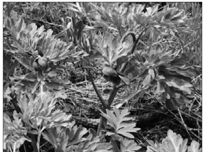
Partially shaded plants of Brown's peony with stout purple-red stems and buds in early spring at the Puffer Butte location.

Of the 50 mature seeds I collected at Green Ridge, 92% were filled and appeared viable. Fully developed seeds are plump and contain a starchy white endosperm and a tiny embryo at one end. Seeds vary in size, ranging from 0.2 to 0.5 inch at their widest diameter.