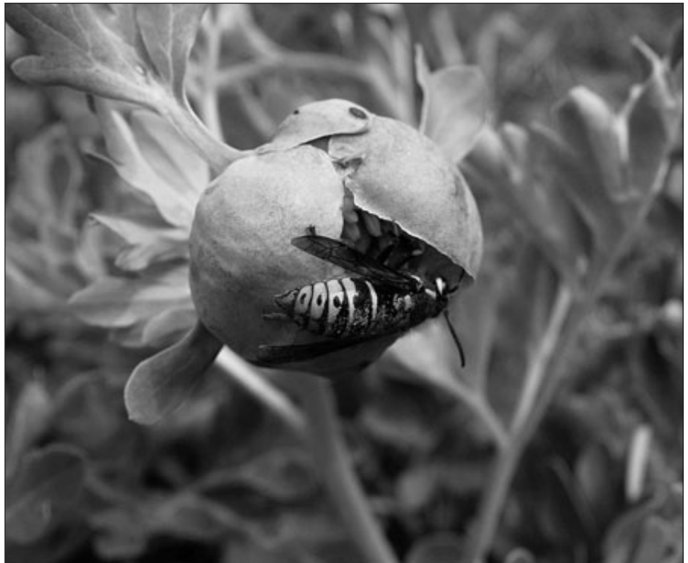
A large hornet queen ( Dolichovespula adulterina ) forages for nectar on a partially opened peony flower.

There was ample evidence at the Blue Mountains reserve that the wasp queens gorged on nectar during the spring months. Euthanized wasps leaked nectar when pinned and nectar volume