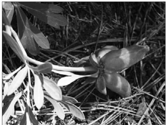
The fully developed fruit of Brown's peony beginning to ripen.

they accidentally pick up pollen grains. A diverse mix of pollen grains on these bees suggested that they frequented a variety of co-flowering shrubs and herbs and visited the peony flowers only for nectar. In the spring, females may take nectar back to the nest to mix with the pollen to feed the larvae; or they may stop for nectar to renew their energy while returning to their nest after gathering pollen (the bee equivalent of stopping for a double latte on the way home from work). Although bees appeared to visit Brown's peony at the Blue Mountain study site after flowers petals opened during