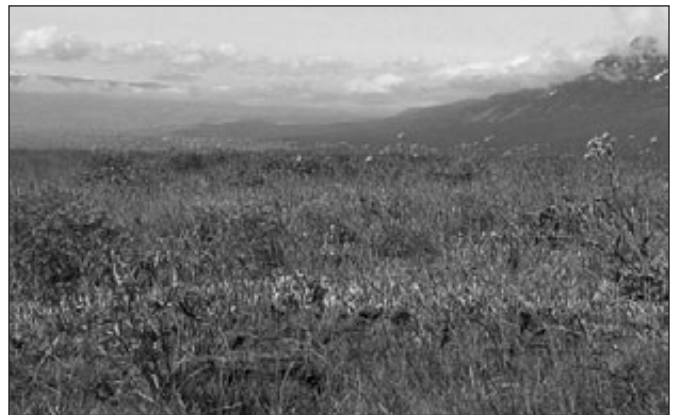
Open prairie at the Blue Mountains site in eastern Oregon; Brown's peony in foreground.

The location of the flowering and pollination study was on the scabland of a shield volcano at about 3,500 ft. elevation within the 6-million-acre Blue Mountains Ecological Province in eastern Oregon. Here, in a mesic-to-xeric bunchgrass prairie adjacent to a coniferous forest, about 300 individuals were scattered in a mixture of grasses, broadleaf herbs, and shrubs. Insect-pollinated species associated with the Brown's peony included redstem ceanothus ( Ceanothus sanguineus ), wild rose ( Rosa nootkana , R. gymnocarpus ), snowberry ( Symphoricarpos albus ), monkshood ( Aconitum columbianum ), balsamorhiza ( Balsamorhiza sagittata , B. hookeri ), ragged robin ( Clarkia pulchella ), hairy clematis ( Clematis hirsutissima ), Delphinium sp., Wyeth buckwheat ( Eriogonum heracleoides ), desert parsley ( Lomatium dissectum , L. triternatum ), sulphur lupine ( Lupinus sulphureus ), Penstemon spp., varileaf phacelia ( Phacelia heterophylla ), cinquefoil ( Potentilla glandulosa , P. gracilis ), sagebrush buttercup ( Ranunculus glaberrimus ), American vetch ( Vicia americana ), and mulesear ( Wyethia amplexicaulus ). The peony colony at this site flowers from mid April through mid May.