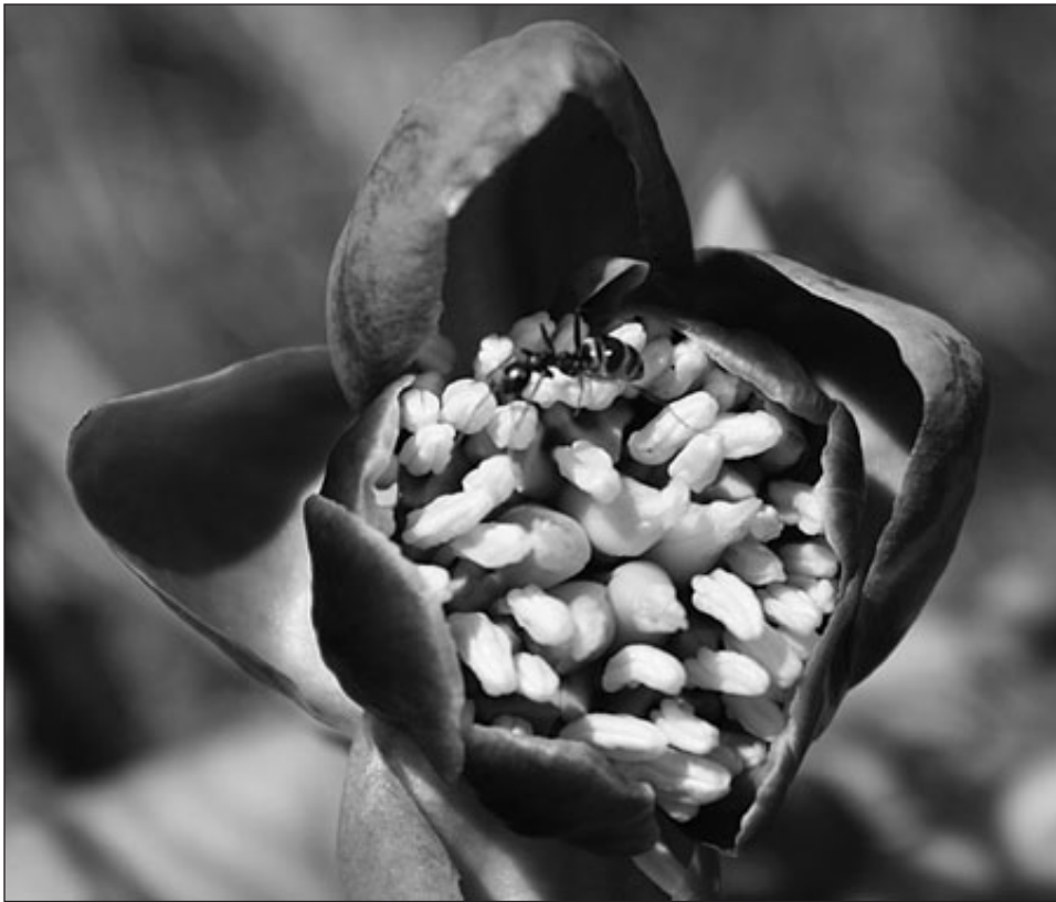
Open flower, revealing stigmas, anthers and partially hidden lobes of the nectariferous disc.

Seeds are food for rodents as well as arthropods, so animal dissemination is possible (Schlising 1976). Although birds and rodents travelling with seeds may drop or bury them, I saw no direct evidence of that; instead, I noted seedlings close to the parent plants. Sometimes seeds from a single flower germinated together to form a small cluster.