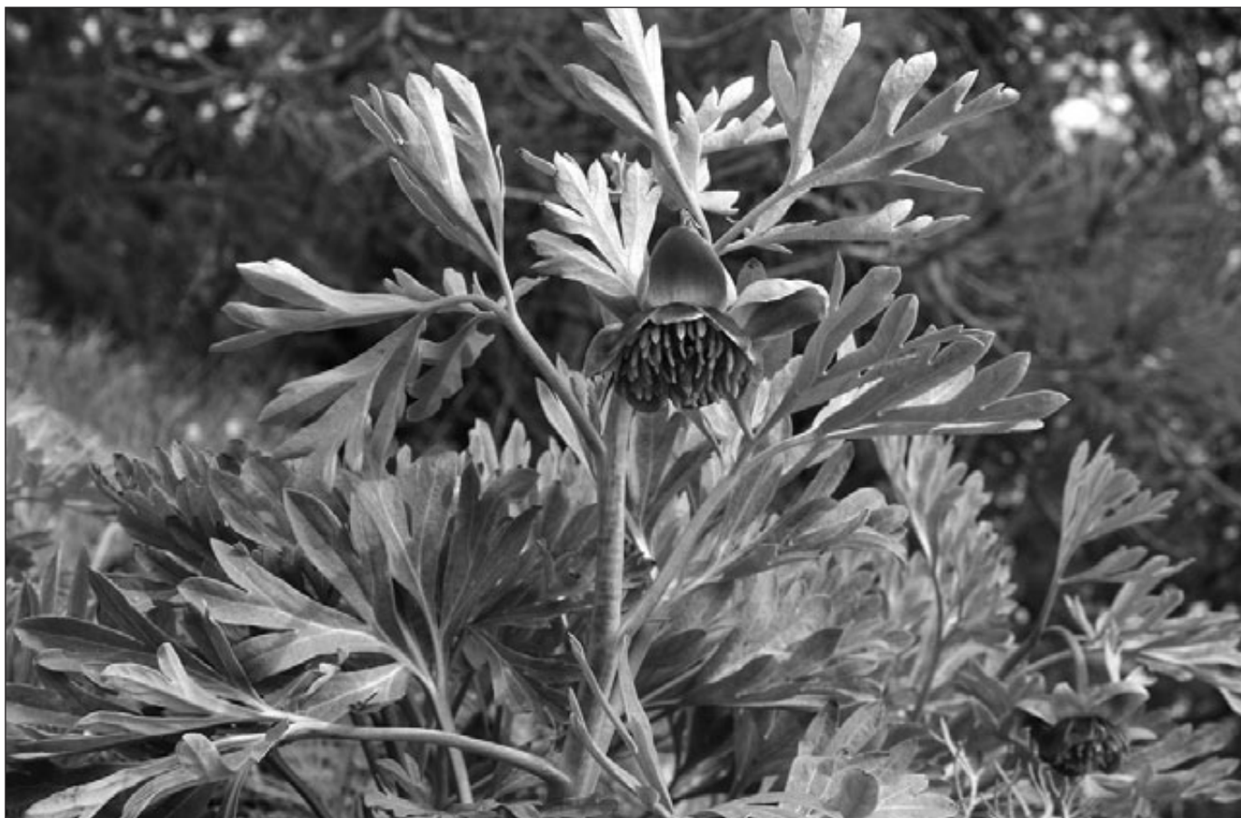
Brown's peony flowering in open prairie near the forest edge.

3930 NW Witham Hill Dr., Corvallis, OR 97330