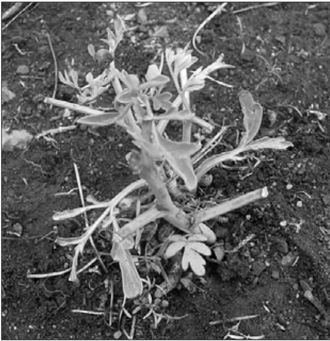
Brown's peony browsed by a large ungulate, presumably elk.

numerous shrubs and forbs flowered concurrently with the peony: prostrate ceanothus ( Ceanothus prostratus ), greenleaf manzanita ( Arctostaphylos patula ), Carey's balsamroot ( Balsamorhiza careyana ), dwarf hesperochiron ( Hesperochiron pumilus ), woodland star ( Lithophragma parviflora ), chocolate lily ( Fritillaria lanceolata ), and two desert parsleys ( Lomatium triternatum and L. nudicaule ). Perhaps because of the recent wildfire, the peony plants had been heavily browsed. Brown's peony began flowering in late April and continued through May. In late August I gathered about 50 seeds from several plants that successfully bore mature fruit, although not all seeds were well developed.