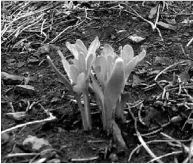
A cluster of peony seedlings that germinated where the seeds fell from the fruit.

the staminate phase, at Green Ridge and Puffer Butte I observed solitary bees visiting peony flowers throughout their lifespan.