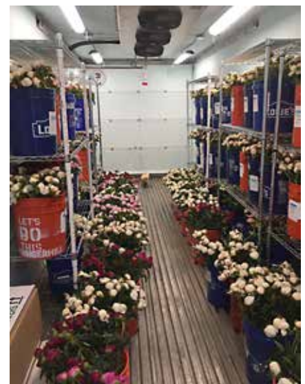
› Peonies in on-farm refrigerator. Fox Hollow Peonies, Nenana, Alaska. Submitted by Wanda Haken.

In humid and rainy parts of Alaska, a black, sooty mold fungus grows on the nectar, especially the quantities that collect at the base of the flower bud. The buds must be pre-treated with a fungicide or individually washed after harvest to remove this mold before sale. Some growers include honey bee hives in their peony fields, and they are very efficient at collecting the nectar and minimizing the mold problem. Sooty mold is a problem in the South Central and Kenai Peninsula Regions, but not Interior Region. Occasionally, aphids will appear on peonies but mostly in fields surrounded by birch trees ( Betula alaskana ). Two significant insect pests are thrips and lygus bugs. Thrips cause bud distortion, bud abortion, flower drop and bruising on petals. Up to 12 species of thrips have been identified including western flower thrips that can cause flowers to be rejected during inspections for foreign shipments. Dr. Beverly Gerdeman (Entomologist, Washington State University, Mt Vernon, WA) has shown