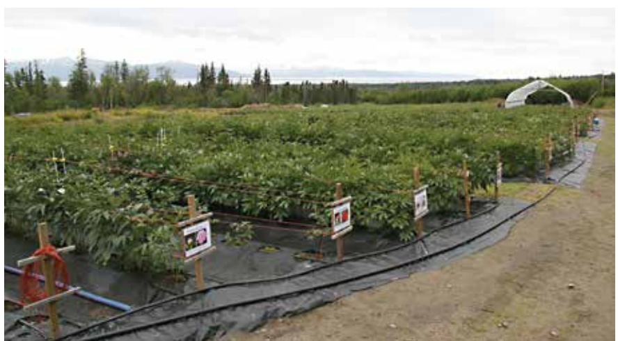
▶ Alaska's oldest peony farm, Alaska Perfect Peonies. Submitted by Rita Jo Shultz.

In general, when sepals separate, peony petals show true color, and the buds begin to soften, harvest begins. In the North, where daylight can reach nearly 24 hours, harvesting occurs nonstop for 12-14 hours per day. If the markets are wholesale distributors or if they require long distance transport, buds