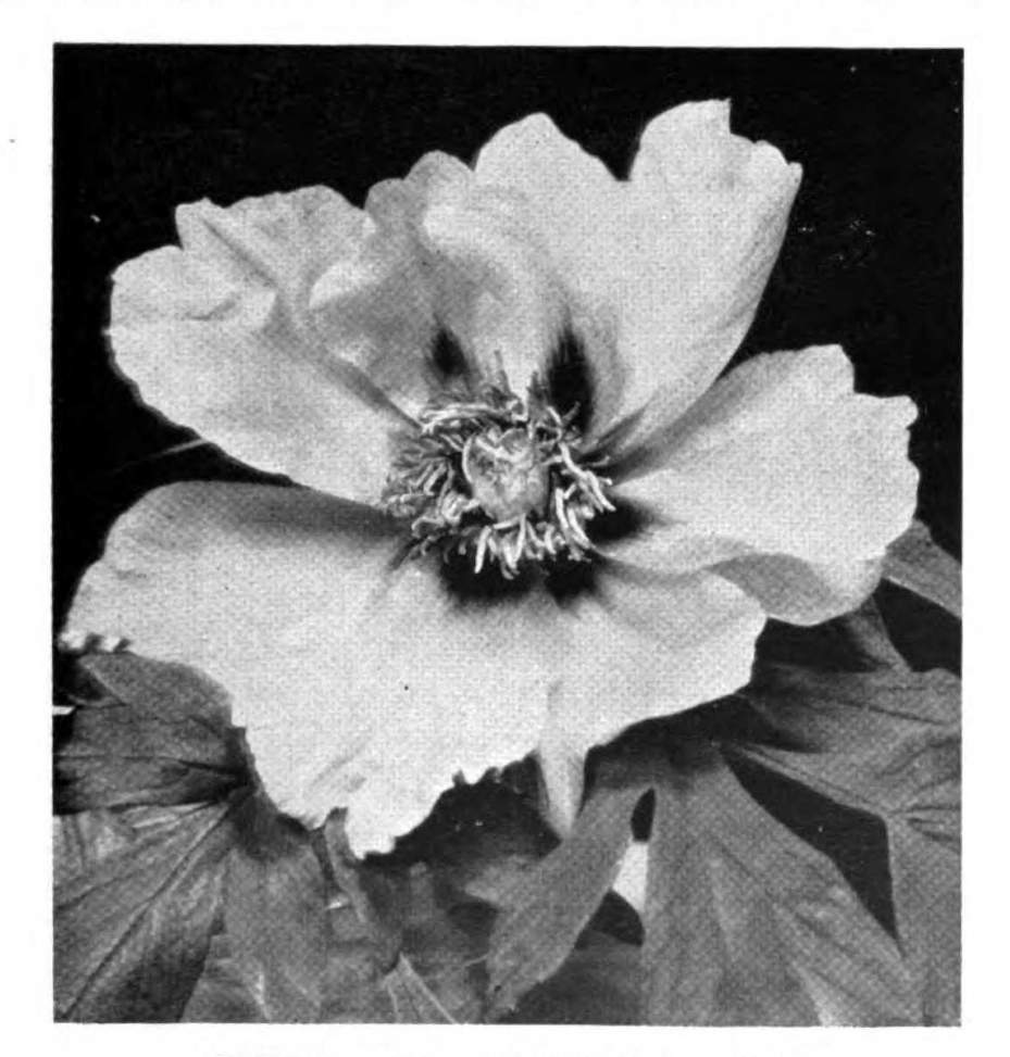
TREE PEONY - ARGOSY (Saunders) Clear Sulphur Yellow, Purple Red at Base

Argosy (Saunders) is the only American origination from the Lutea at present. The blooms are considerably larger and of a