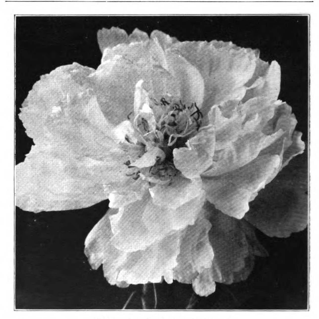
REIN KAHU (Flight of Cranes) Pure White

rose colored flat bloom sometimes attaining the size of an ordinary dinner plate. Seidai (Glorious Reign) and Yoyonohomare (King of Peonies) are two of the older varieties which attract attention in any garden.