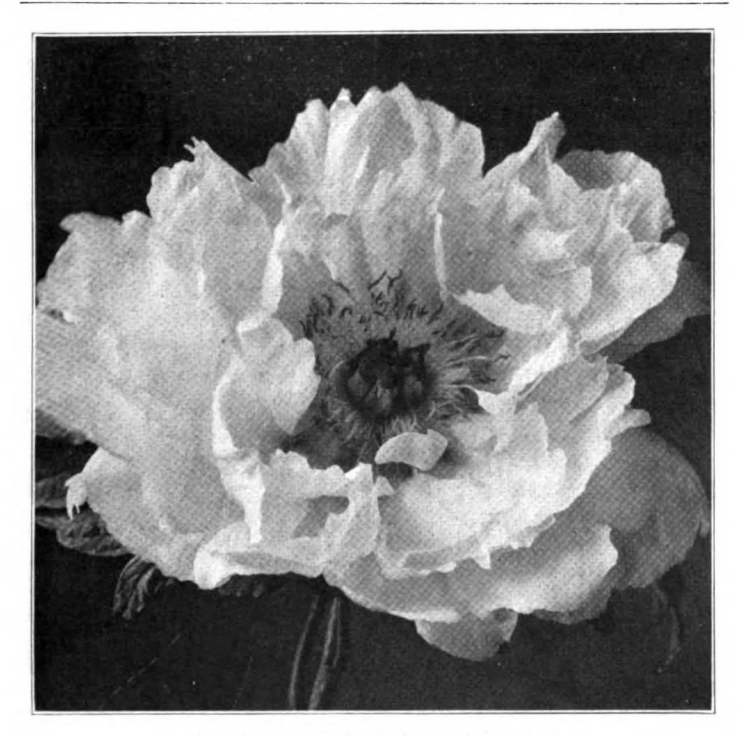
YOYONOHOMARE (King of Peonies) Bright Rose Pink

top. Miyo-no-Hikari (Light of the Era) is similar to Ukaregi-Ohi, only it is a shade darker and a bit larger. Both of these are wonderful salmons and have very crinkled petals.